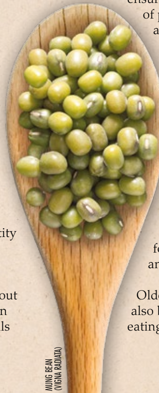
MUNG BEAN (VIGNA RADIATA)

Older people can also benefit from eating pulses.