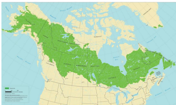
Fig2. Highlighted area on the map of North America shows the extent of the Boreal Forest region in Canada.

The Boreal Forest region of Canada extends across the country at latitudes between 48°N in eastern Canada up to 65°N in western Canada (Fig 2). For this region, predictions will be generated from point data contained within the National Soil Carbon database and the National Forest Inventory database together providing around 3,000 high quality pedon records that contain SOC values. This work will be conducted at 250 m resolution, using a range of national scale covariates and DEM where the final product will be generalized to the 1 km spatial resolution.