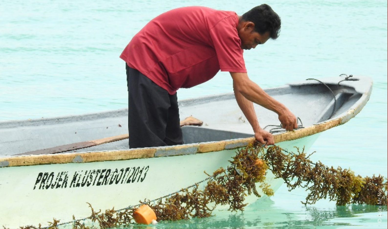
Manual cleaning of seaweed by a seaweed farmer