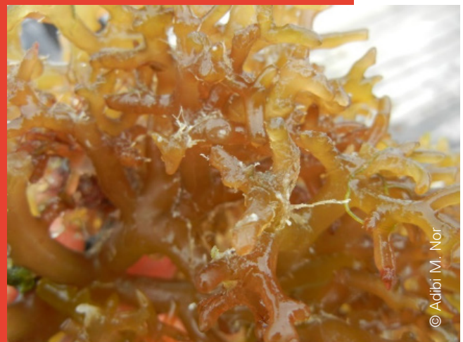
Biofilm 'white mucous' on a brown strain of Kappaphycus striatus seaweed