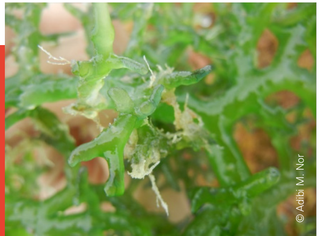
Biofilm 'white mucous' on a green strain of Kappaphycus striatus seaweed

Seaweed farmers are unlikely to buy new equipment when starting a seaweed crop. Therefore, Kambey et al. (2021) recommended an extended period of sun drying to reduce pathogen loads. Further study is required to confirm that increased labour costs for biosecurity implementation are offset by increased production and seaweed quality (carrageenan and gel strength) in other areas of the world besides Malaysia.