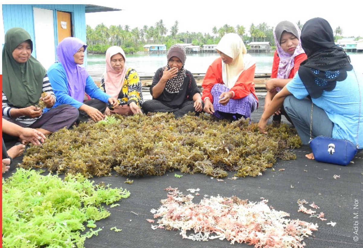
Women's participation in seaweed farming as a household enterprise

While biosecurity protocols to minimize the likely risk of introduction and spread of disease pathogens and pests are applied to the production of most aquatic fish and shrimp species, they are not generally applied to seaweed production.