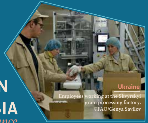
Employees working at the Skvyrskyi grain processing factory.