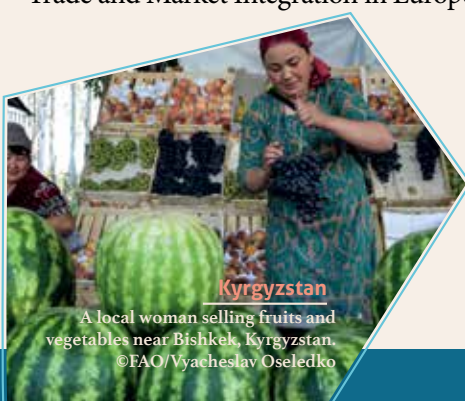
Kyrgyzstan A local woman selling fruits and vegetables near Bishkek, Kyrgyzstan.

As part of the project FAO continued to support the Agricultural Trade Expert Network in Europe and Central Asia (ATEN), established in 2014. ATEN brings together experts who conduct research and training and advise governments and private sector on agricultural trade issues in the region, including participation in regional and multilateral trade agreements.