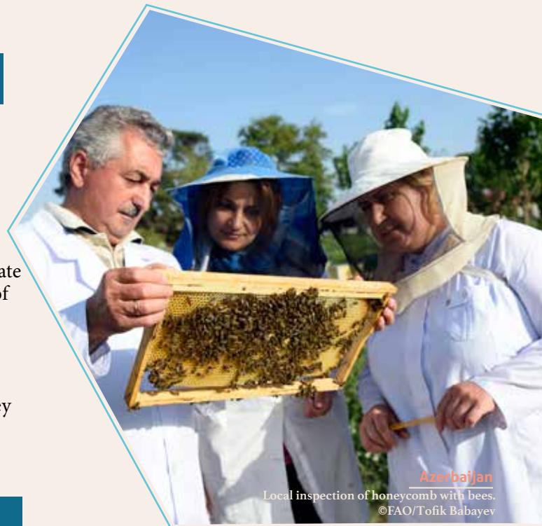
Azerbaijan Local inspection of honeycomb with bees.

New partnerships were also formed with private sector organizations such as the National Union of Food Exporters of Russia, the Ukrainian Association of Honey Exporters and Processors of Honey (UAHEP), and the Union of Millers of Ukraine.