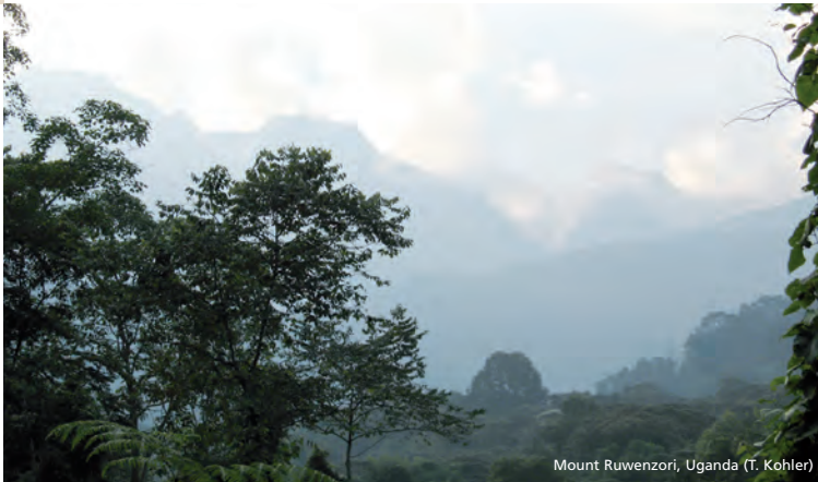
Mount Ruwenzori, Uganda