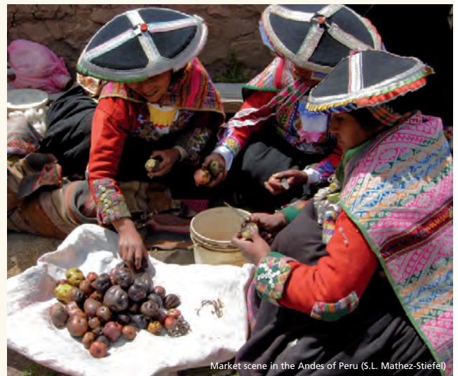
Market scene in the Andes of Peru

population live in transition and developing countries. Close to 30% of them, or 300 million people, are vulnerable to food insecurity and many of them live in extreme poverty. Access to basic infrastructure such as health and education is often poor, increasing the marginalisation of mountain communities. Mountains are particularly susceptible to environmental hazards, causing disasters, such as devastating floods, landslides, or avalanches leading to loss of life, property, and livelihoods. Many mountain areas are in tectonically active zones with an increased probability of earthquakes and volcanic eruptions. At a global scale, 55% of mountain land is susceptible to earthquakes, as opposed to 36% of non-mountain land. Mountains are also very sensitive to climate change, as shown by the rapid melting of glaciers worldwide; the consequences reach far beyond mountain regions.