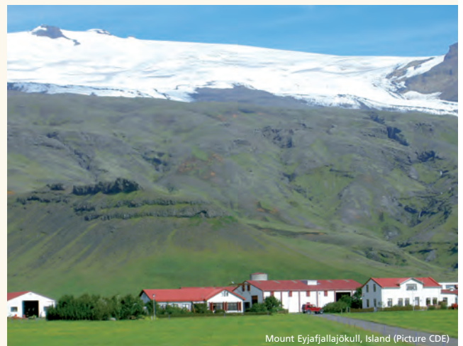
Mount Eyjafjallajökull, Iceland (Picture CDE)