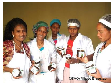
Partnerships and Outreach