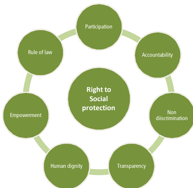
Figure 3: Right to social protection and PANTHER principles

When designing, implementing, monitoring and evaluating social protection (and other development) programmes states must ensure compliance with the human rights “PANTHER” principles including: a) participation; b) accountability; c) non-discrimination; d) transparency; e) human dignity; f) empowerment; and g) rule of law (FAO, 2009:29).