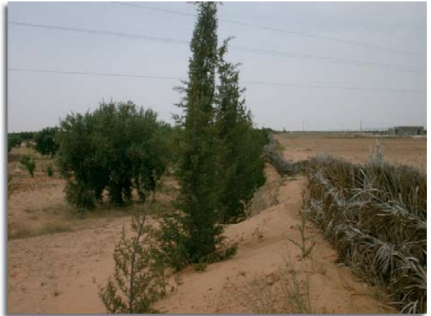
Encroaching sand is held back by barriers and tree-planting

From an institutional point of view, can the NAP/CDs be used as a basis for drafting part of the NAPAs for adaptation in dry areas? Might it not be possible to identify common actions to be undertaken when both documents have been written?