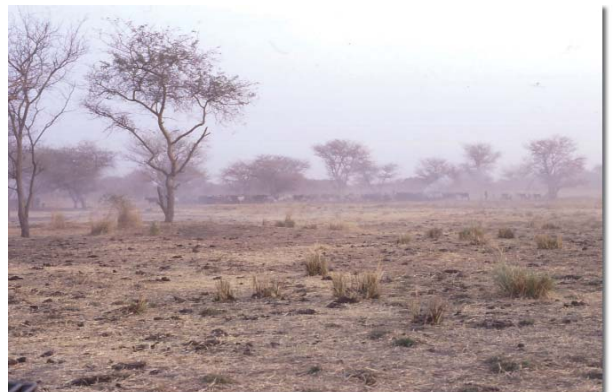
When drought prevents normal crop growth, plants wither and die