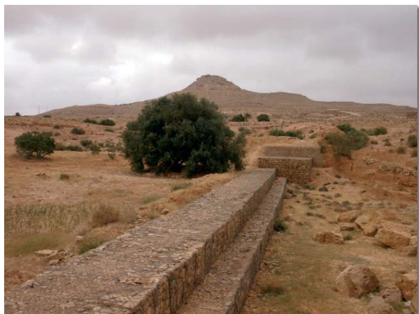
Dry stone walls are among the many practices developed to prevent soil erosion

the UNFCCC Parties, in Nairobi in November 2006, recognised that the effects of climate change will be experienced to a disproportionate extent in developing countries, which are more vulnerable and incapable of reducing these effects and which risk losing some of the gains achieved by their current development. In this framework, the SBTA (Subsidiary Body for Scientific and Technological Advice) renewed the programme to study impacts, vulnerability and adaptation to climate change for a period of two years. It should, in particular, produce information on climate risks and other socio-economic information on adaptation practices and plans as well as suggest technologies for adaptation and different types of economic diversification.