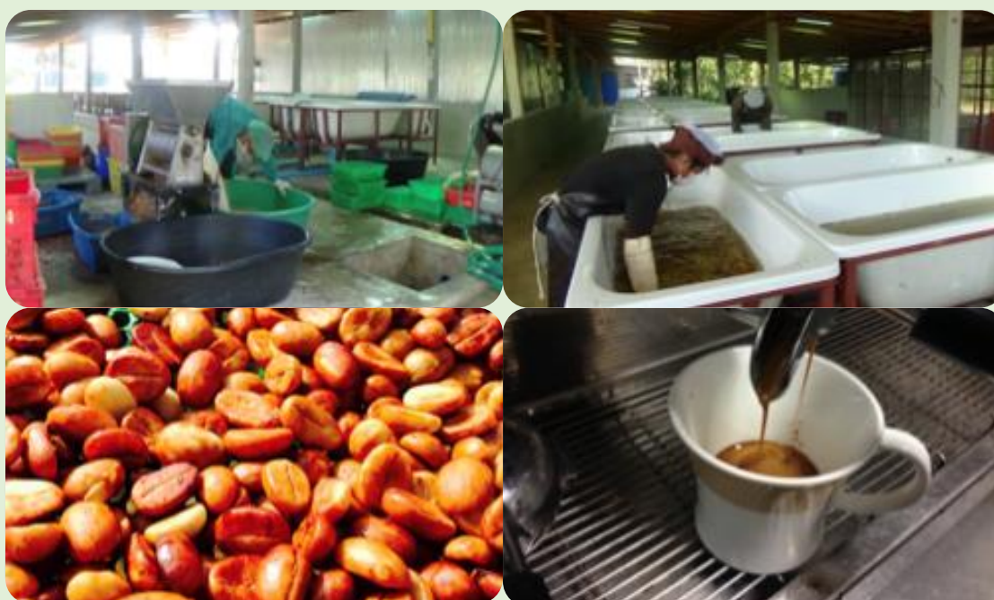
Figure 4. Coffee process

These successful testimonies can be found in the areas of 1,144 families, mainly concentrated in Mae Win, Mae Wang, Chiang Mai Province. The model has now been replicated at Pang Hin Fon, Mae Cheam, Chiang Mai Province. We hope to see an increase in fertility in this land by 2020.