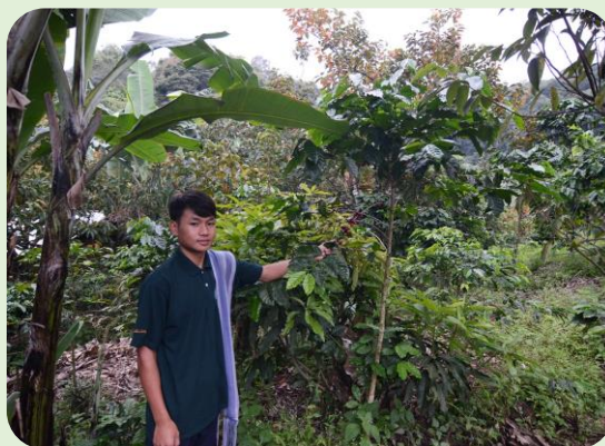
Figure 3. Coffee trees

Currently, our distribution channel is mainly to local coffee shops. However, the local way of consumption does not provide a market for the specialty coffee growing process that we use. Therefore, we are currently targeting Thai 5-stars hotels to make our brand known and hence to be able to sell it at a higher and fairer price. To do this, we need more and more good cherries. Consequently, we are encouraging, by means of financial incentives, our farmers to deliver better quality.