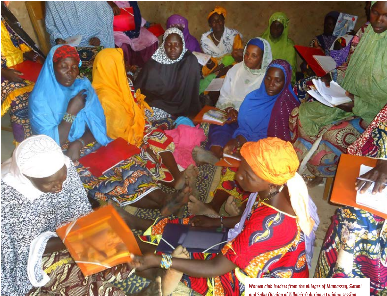
Women club leaders from the villages of Mamassey, Satoni and Saba (Region of Tillabéry) during a training session