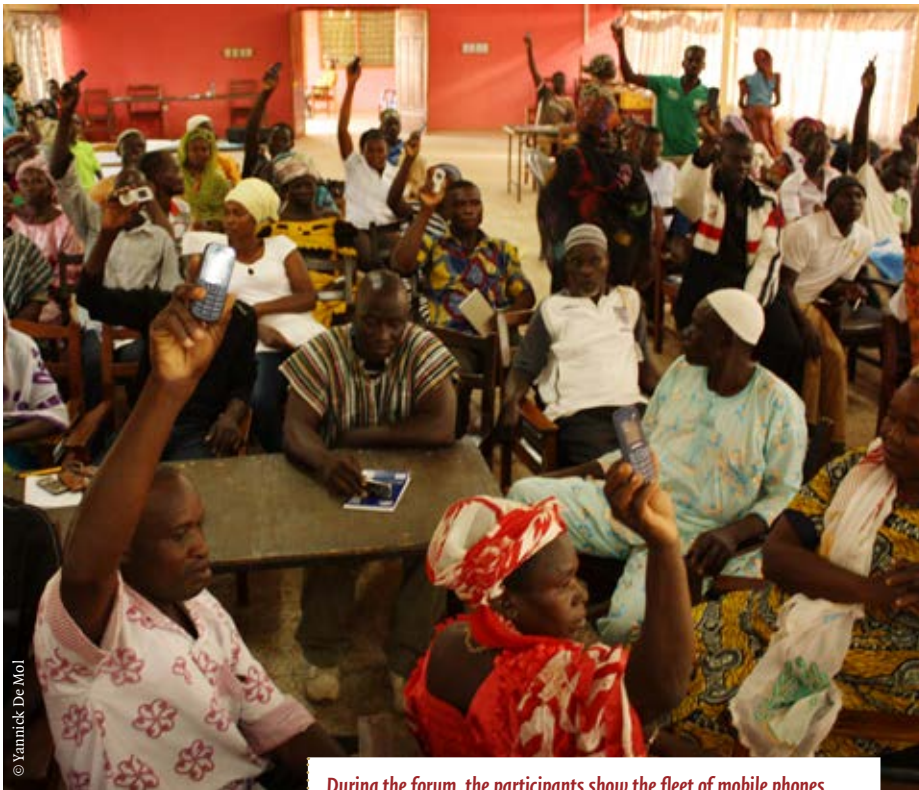
During the forum, the participants show the fleet of mobile phones

declared “Thanks to the Listeners’ Clubs I learnt how to help my wife in the household”. Another man echoed him: “before my wife was only allowed to eat wings and neck of the chicken, because it is a tradition of our region. But, thanks to the Dimitra Club I realized that this is only a taboo. My wife now can also eat other parts of the chicken, just like anyone else in the family”.