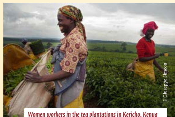
Women workers in the tea plantations in Kericho, Kenya

"Improving Gender Equality in Territorial Issues (IGETI) 4 " represents a new methodological approach where the territory is considered as an "entry point" to promote gender equality in land access and territorial development. It allows an improved understanding of different values, visions and interests of men and women related to access, use and management of land and other resources.