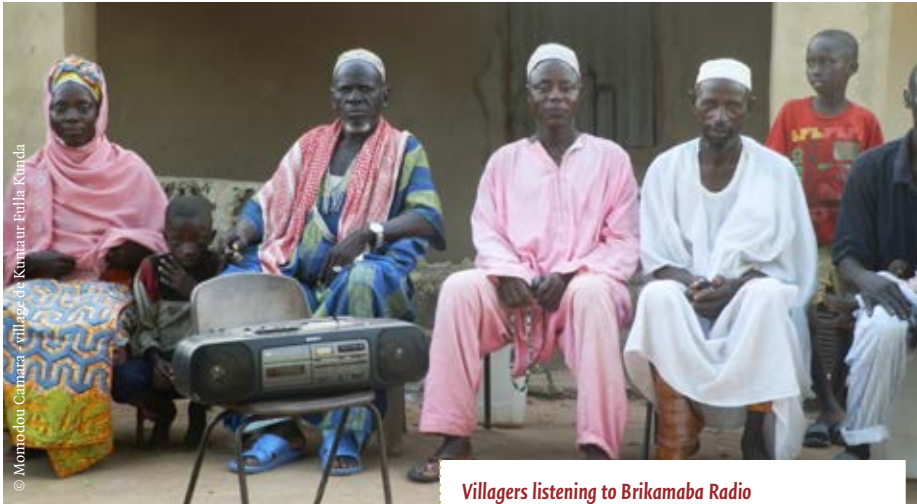
Villagers listening to Brikamaba Radio

Reinforcing the links among forest and farm producer organizations is key for improving rural communities' livelihoods. In the Gambia, with the support from the Farmer Forest Facility (FFF), participatory communication and community radios are being used successfully for that purpose.