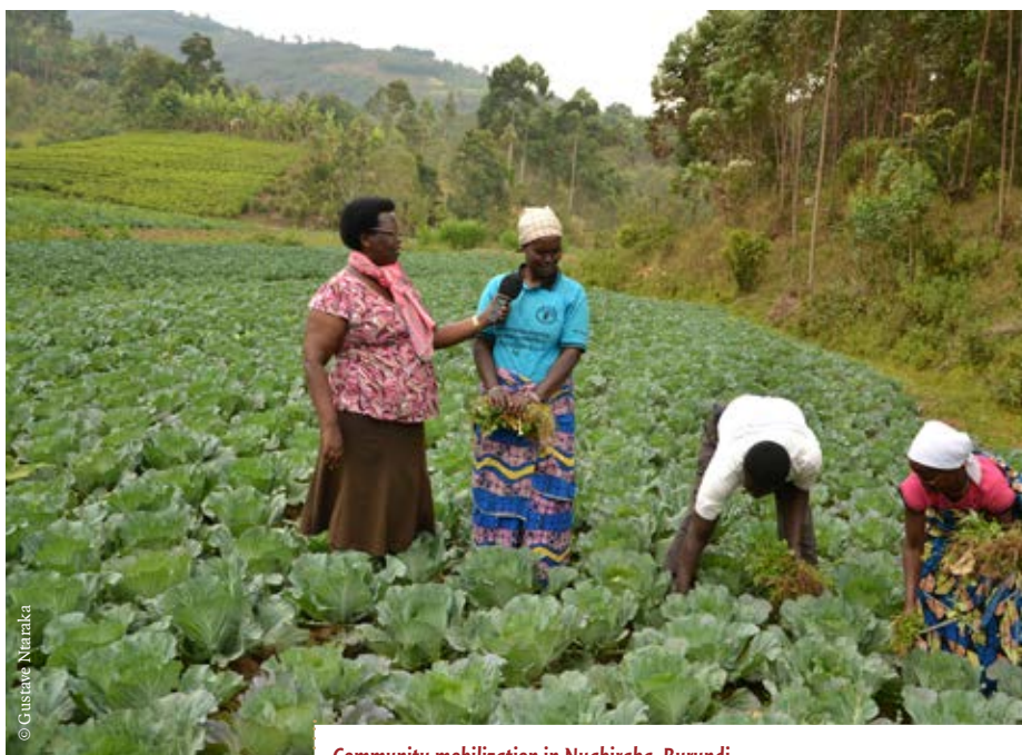
Community mobilization in Nyagiraba, Burundi.

FAO is seeking to engage partners in a strategic dialogue, so as to attract both more unearmarked resources for high level results and more earmarked resources for specific technical themes and/or geographical priorities.