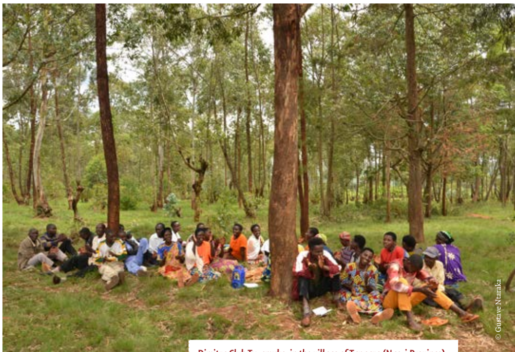
Dimitra Club Tuzamuke, in the village of Tangara (Ngozi Province)

Training sessions for the 15 new Dimitra clubs will be organized next year to strengthen the knowledge of club officials, and by doing so, empower them in terms of gender and participatory communication.