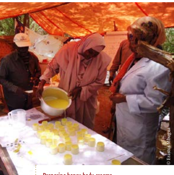
Preparing honey body creams

This is the successful story of a beekeeping group from Beer village, in Somaliland, north-western Somalia. The group benefited from an initiative aimed at strengthening the resilience of women and men to economic shocks. This beekeeping initiative was implemented under the Sustainable Employment and Economic Development Programme (SEED), under the patronage of the Ministry of Livestock of Somalia, the British Department for International Development (DFID), the FAO and private suppliers for inputs and hives.