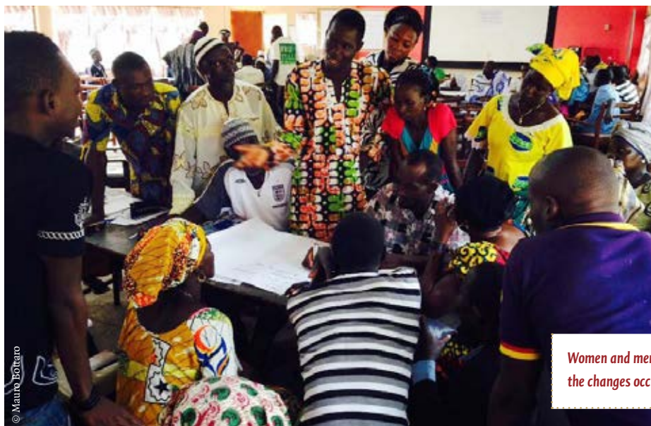
Women and men identify together the changes occurred in their communities

In this respect, even more extraordinary are the statements made by some of the men present at the workshop and that perfectly convey the idea of the dynamics triggered at community level. A man from the community of Sori