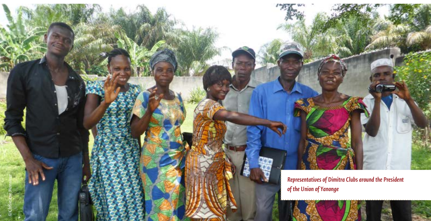
Representatives of Dimitra Clubs around the President of the Union of Yanonge

Five producers’ organizations (PO), seven Dimitra clubs (out of the nine clubs operating in the Yanonge Eastern Production Basin), four grassroots community associations (NGOs) and the Yanonge UOPA were the first to sign up. Each of the cooperative members (legal