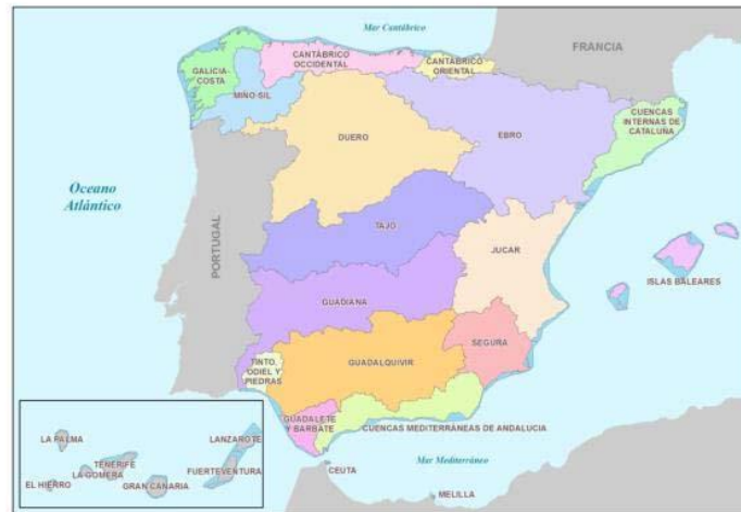
Figure 2. River basin districts in Spain