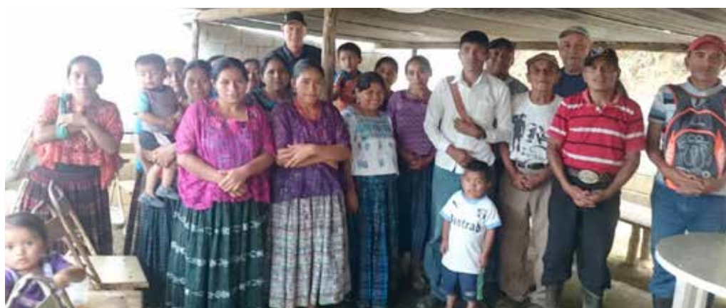
Community seed bank at Olopa Chiquimula, Guatemala