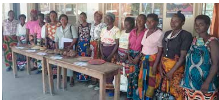
Local varieties of sorghum, millet, cowpea and yams tolerant to drought displayed by farmers in Salima District, Malawi