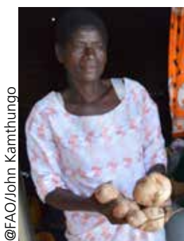
A female farmer showing sweet potato variety in Lisungwi, Malawi