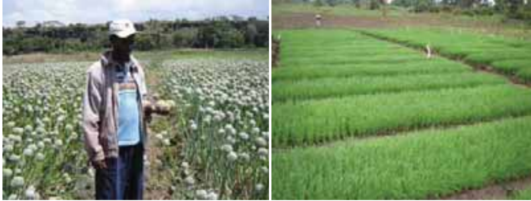
Picture: Quality onion seed production and seedlings raised from seed produced by farmers in Arsi, February 2009