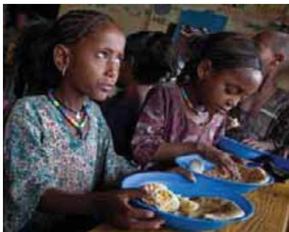
Photo Caption: School feeding is one of the wide range of activities undertaken by FAO under its long-term food security and nutrition programme.

Altogether, FAO interventions have directly and indirectly contributed to increased production, agricultural diversification and the protection of productive assets.