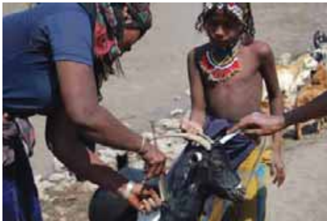
Photo Caption: A female CAHW in action during a recent FAO-supported vaccination campaign in the pastoral areas.

Efforts were also made to address trade barriers related to disease prevalence, which included bans based on fear and safety requirements of importing countries (with special reference to Rift Valley Fever). FAO studied the issue with a view to establishing disease free zones in Ethiopia to ensure implementation of biosecurity and a routine programme for monitoring disease exclusion.