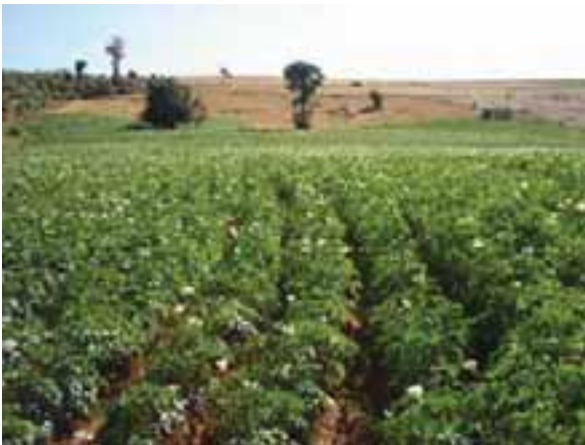
Photo Caption: Quality disease free potato seed tuber production by farmers in Arsi, February 2010

Lastly, a number of traditional irrigation schemes have been upgraded and rehabilitated, covering 235 hectares of land benefiting 550 households and organized under three Water Users Association (WUA), in an effort to increase production of high value crops and diversify income sources of farmers so as to improve their livelihood situation. As a result, for instance, 500 households in Oromia are now able to produce high value vegetables twice a year on 235 hectares of land, resulting to increased income. Additionally, the rehabilitation and construction of the five schemes in Tigray and Amhara regional states also resulted in the proper harvesting and efficient use of water from the rivers for irrigated crop production on 295 hectares of irrigable area, benefiting 1 150 farmers.