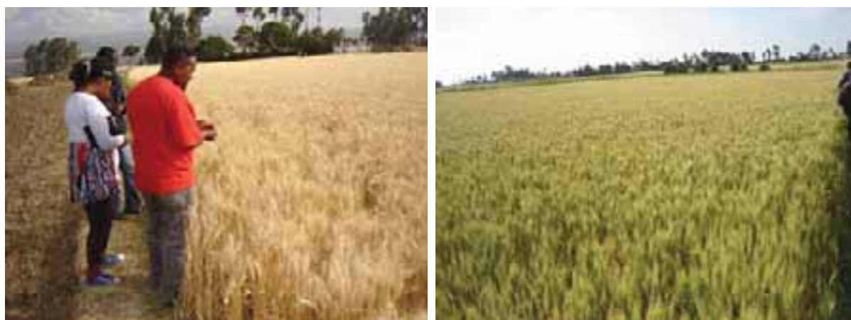
Figure 1: The regional seed quality control and certification laboratory experts while inspecting wheat basic seed production fields to ensure quality seed production by seed producer cooperatives in Hetosa, 2010

FAO has also ensured quality seed availability (such as improved tuber crops, cereals and vegetable seeds, as well as fruit seedlings) to vulnerable households in response to emergencies, as well as a disaster risk reduction strategy. Lastly, in the pastoral region of Afar, FAO is developing the capabilities of the regional government and of farmers in date palm cultivation improvement and full utilization through the provision of modern technologies, expert advice, training, and introduction and propagation of high quality planting material.