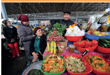
Overview of Food Security in the Countries of the Economic Cooperation Organization

Among other activities, the project will provide technical support to ECO-RCC to develop an Overview of Food Security in ECO Countries and to update the ECO Regional Programme for Food Security (RPFS) .