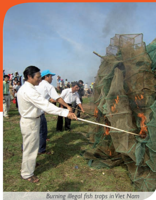
Burning illegal fish traps in Viet Nam

Enforcement efforts play a major role in the management of fisheries resources. However effective enforcement, especially at community level, can be expensive and at times dangerous. Enforcement efforts should be guided by regulations and management plans, while close collaboration between communities and authorities is vital.