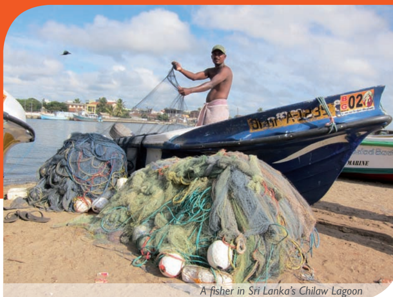
A fisher in Sri Lanka's Chilaw Lagoon