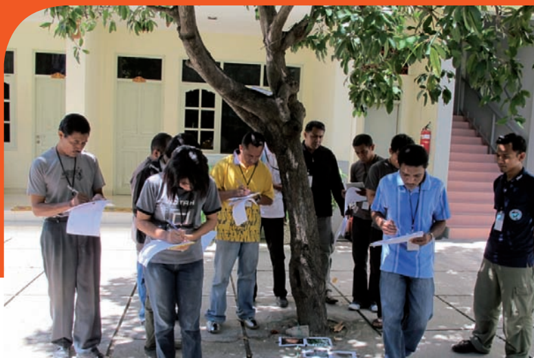
Indonesian fisheries staff learn new monitoring techniques

Co-management can be complex and involves a wide range of different subject areas and skills. The capacity of all stakeholders needs to be built as part of an on-going process to ensure that informed management decisions are made, implemented, monitored and the impacts of management actions evaluated.