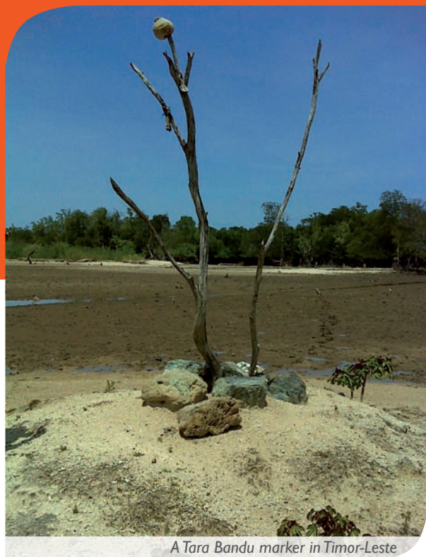
A Tara Bandu marker in Timor-Leste

traditional Tara Bandu laws. Tara Bandu are used by communities to regulate relations between people and groups as well as between people and the environment. Although they have existed for a long time, Tara Bandu have rarely been written down. RFLP helped create an agreed written version as part of an initiative to facilitate better resource management at community level and to have Tara Bandu recognized by the Timorese legal system.