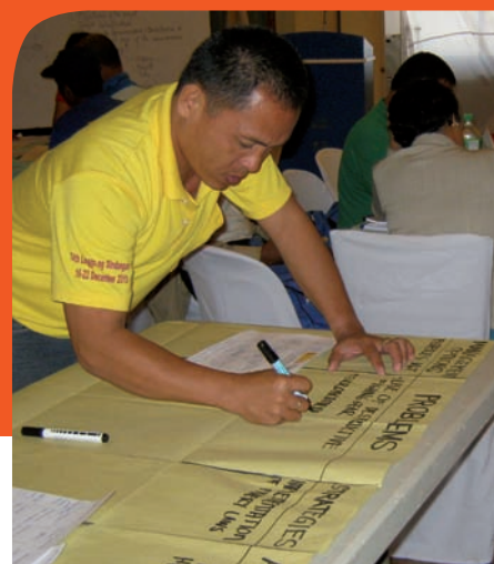
Developing coastal resource and fisheries management plans in the Philippines

Plans for the co-management of resources can take many forms and range from the short and simple to the long and complex. They should be devised in a participatory and transparent manner and be holistic, realistic, and practical.