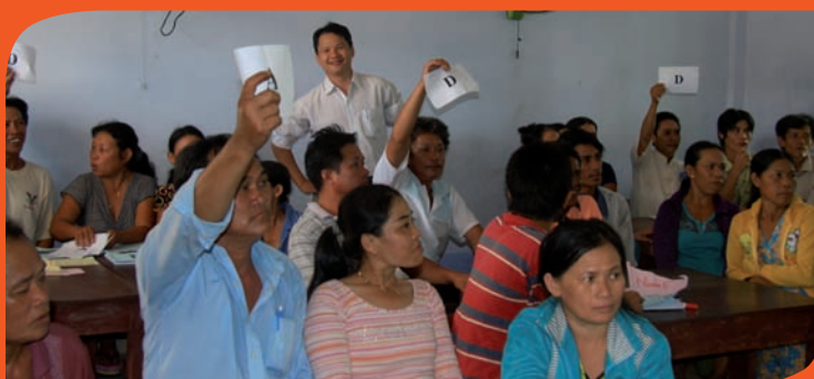
Members of a Fisheries Association meet in Viet Nam

For co-management to be effective the active cooperation of all stakeholders is needed. Efforts should be made to avoid domination by any single group, as well as to pro-actively seek the involvement of women.