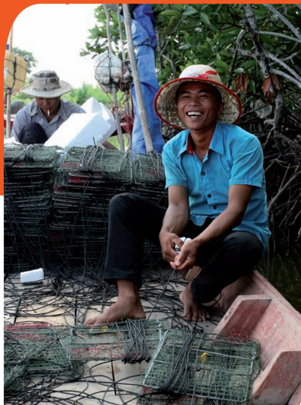
A fisher with crab traps in Kep province, Cambodia