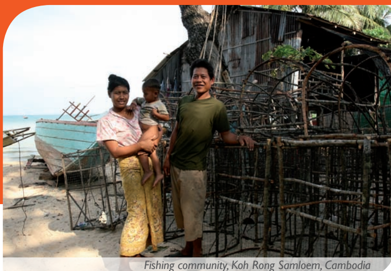
Fishing community, Koh Rong Samloem, Cambodia