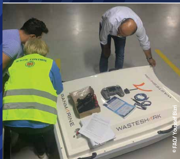
Figure 6. Aquadrone

They can be operated either manually via an onshore operator (radio controlled) and autonomously with online control and access, thanks to an on-board algorithm detects whenever then drone reached its full capacity. Thus, they are suitable to cover large surface area such as dams to collect floating debris before entering the river and irrigation canals and along the shoreline. Moreover, due to the drones' mobility, there is a high flexibility to transfer the technology from one site to another.