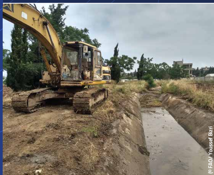
Figure 2. Rehabilitation of the canal