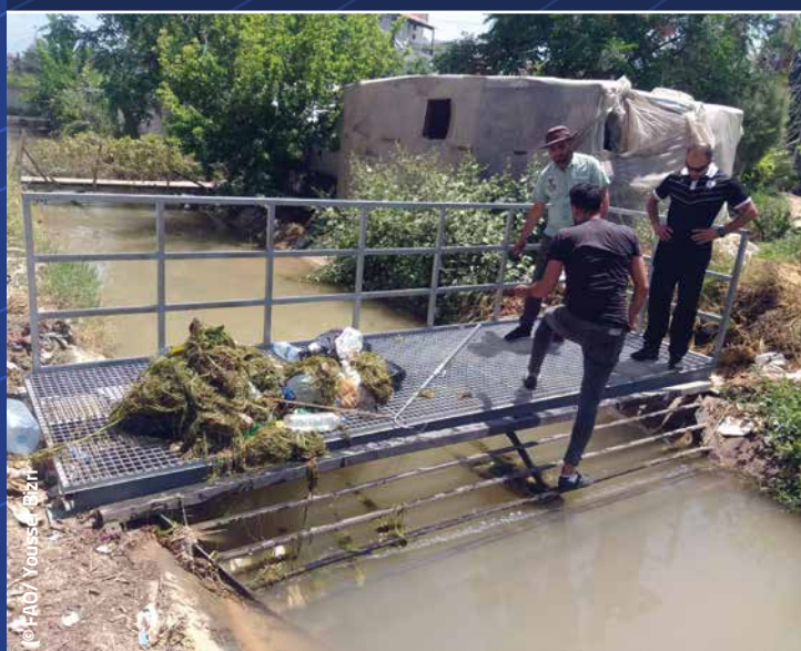
Figure 1. Trash removal equipment installed in Akkar canals