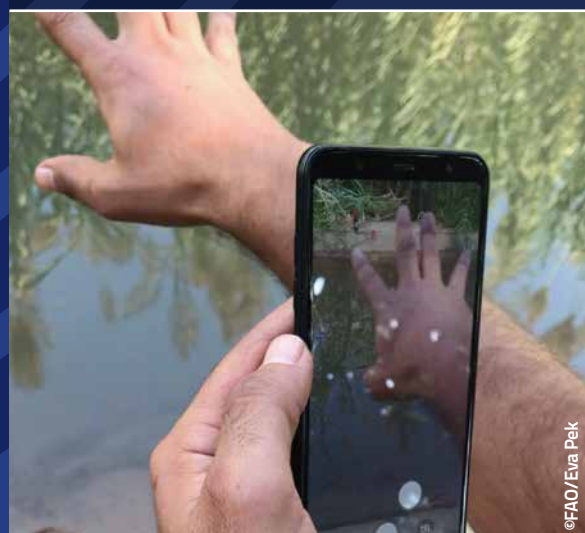
Figure 7. Obtained discharge data via Discharge App

Further information on iMOMO application: https://discharge.ch/