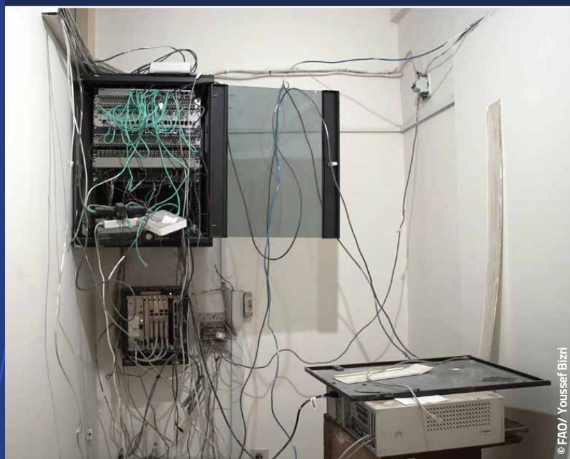
Figure 4. Central level system of PMS

The established Prototype Monitoring System (PMS) at NLWE is an integrated and computerized platform that links the various monitoring components into a comprehensive monitoring system for irrigation water to empower management authorities to better-informed decisions. It combines two complementary methods for data acquisition: in-situ devices for data acquisition of discharge, water quality and weather, and enhanced remote sensing technology for measuring agricultural water demand. In addition, the system integrates an asset management module to enable the inventory, the condition and the criticality scoring of irrigation assets and the rigorous business planning to support decision-makers in planning the adequate operation and maintenance (O&M) of the system and the required budget. The system produces various reports to inform decision-makers about necessary actions in any of the fields.