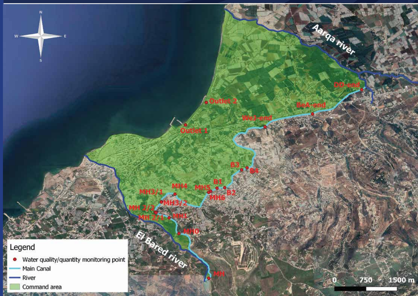
Figure 3. Map covering the project command area