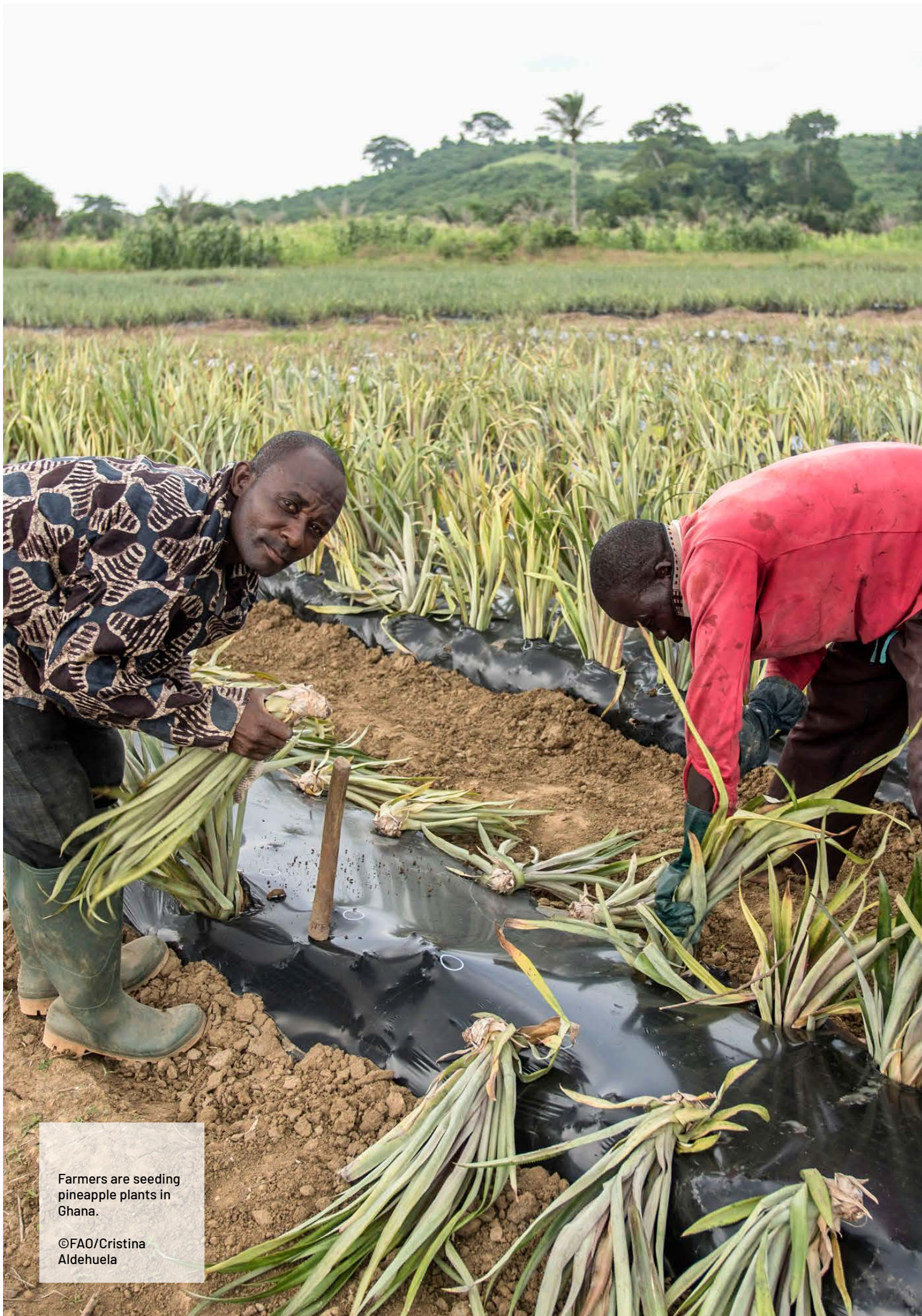
Farmers are seeding pineapple plants in Ghana.