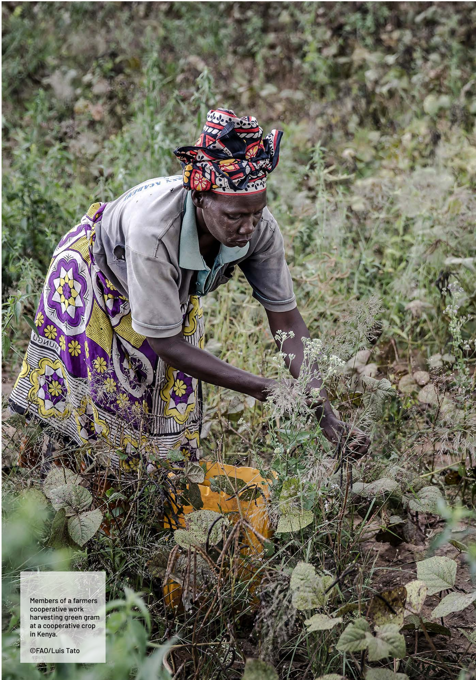
Members of a farmers cooperative work harvesting green gram at a cooperative crop in Kenya.